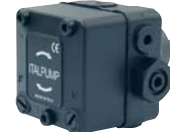
Series PN 30 - 140 l/h pag. 27