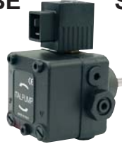
Series PE3/KE3 95 - 130 l/h pag. 23