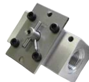
Series ITRE pag. 73