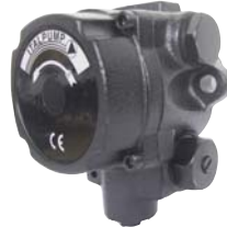
Series G 50 - 380 l/h pag. 38