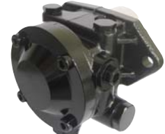
Series ITP 350 - 1380 l/h pag. 46