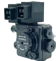
Series GBW/KBW 20 - 70 l/h pag. 15