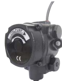
Series N-NR 80 - 420 l/h pag. 42