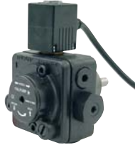
Series GBE/KBE 20 - 70 l/h pag. 7