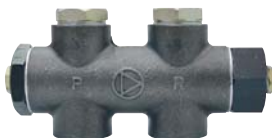
Series ITR-ITRV pag. 66