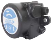
Series AG 50 - 280 l/h pag. 30