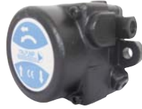
Series AN 65 - 210 l/h pag. 34