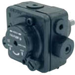
Series GB/KB 20 - 70 l/h pag. 3