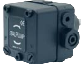
Series P3/K3 95 - 130 l/h pag. 19