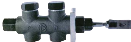
Series ITRP pag. 70