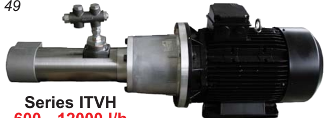
Series ITVH 600 - 12000 l/h pag. 60